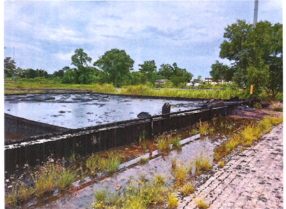
Haphazard Dumping of Oily Sludge inside Geleki CTF