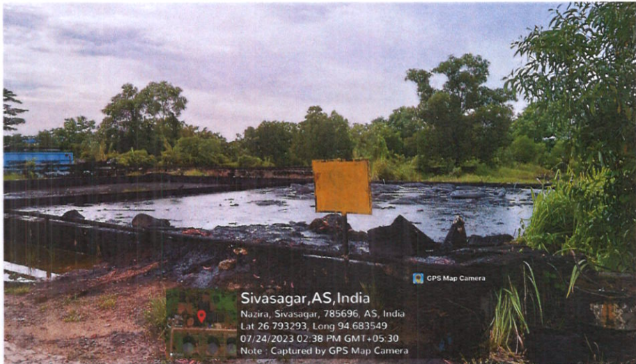
Haphazard Dumping of Oily Sludge inside Geleki CTF (as on 24.07.2023)