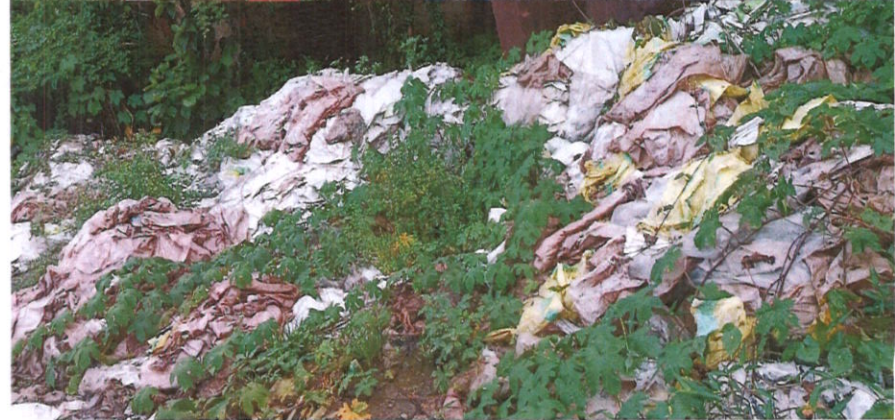
Haphazard Dumping of Hazardous and Other Wastes in Ligoripukhuri Yard, Geleki